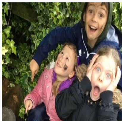
A treasure hunt for litter in Forest school for Year 4.