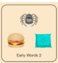
Early Words 2