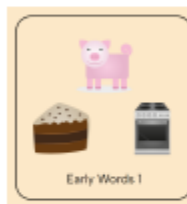
Early Words 1